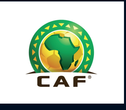
FIFA, <u>CAF</u> 54 members

The main issues facing Africa's football administration systems are systemic and institutionalized. Aside for a relatively small number of nations like South Africa, local leagues and clubs on the continent are generally administered in an amateurish manner, and allegations of match fixing are common. In addition, political meddling creates a setting in which football develops into a complicated social construct where area, culture, politics, and economics all interact to produce very little growth of the game as a thriving commercial entity. However, FIFA's long-standing rules of non-interference have frequently resulted in corrupt officials staying in power for decades. The lack of openness in the game's management has an unbreakable connection to the underdevelopment of the game. Although the kind and extent of corruption may vary from nation to nation, it is evident from the literature that the most, if not all, African countries suffer from substantial administrative issues.